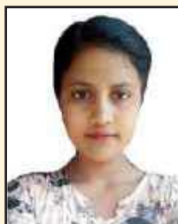
NAVJOT IT Deptt. SRS Fashion World