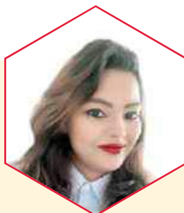
MEGHA Executive SCOTIA Bank Canada