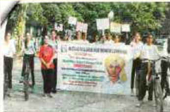
ਮਾਸਟਰ ਤਾਰਾ ਸਿੰਘ ਮੈਮੋਰੀਅਲ ਕਾਲਜ ਵਿਖੇ ਸਾਈਬਰ ਸੁਰੱਖਿਆ ਥੀਮ 'ਤੇ ਪੋਸਟਰ ਮੈਕਿੰਗ ਕੰਪੀਟੀਸ਼ਨ।