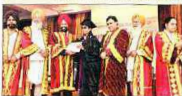
ਮਾਸਟਰ ਤਾਰਾ ਸਿੰਘ ਮੈਮੋਰੀਅਲ ਕਾਲਜ ਦੇ ਫੀਡਬੈਕ ਸਮਾਰੋਹ ਮੇਂ 550 ਵਿਦਿਆਰਥੀਆਂ ਕੋ ਸਿਲੀ ਡਿਗ੍ਰੀਆਂ ਦਿੱਤੀਆਂ ਗਈਆਂ।

ਮਾਸਟਰ ਤਾਰਾ ਸਿੰਘ ਮੈਮੋਰੀਅਲ ਕਾਲੇਜ ਦੇ ਫੀਡਬੈਕ ਸਮਾਰੋਹ ਮੇਂ 550 ਵਿਦਿਆਰਥੀਆਂ ਕੋ ਸਿਲੀ ਡਿਗ੍ਰੀਆਂ