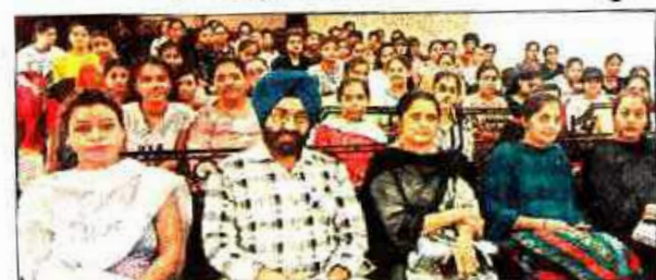
ਮਾਸਟਰ ਤਾਰਾ ਸਿੰਘ ਮੈਮੋਰੀਅਲ ਕਾਲੇਜ ਮੇਂ ਆਯੋਜਿਤ ਸੈਮੀਨਾਰ ਮੇਂ ਹਿਸ਼ਤਾ ਲੇਤੇ ਵਿਦਿਆਰਥੀ।

ਵਿਦਿਆਰਥੀਆਂ ਕੋ ਬਤਾਏ ਸਾਈਬਰ ਠਗੀ ਸੇ ਬਚਨੇ ਕੇ ਗੁਰ