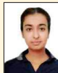
Preetjot JAVA JSS Coading TCS Chandigarh