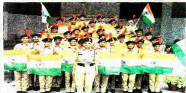
ਮਾਸਟਰ ਤਾਰਾ ਸਿੰਘ ਮੈਮੋਰੀਅਲ ਕਾਲਜ ਵਿਖੇ ਕੌਮੀ ਤਿਰੰਗਾ ਝੰਡੀ ਖੜੀਆਂ ਐਨ. ਸੀ. ਸੀ. ਕੈਂਟਿਨਸ।

ਰਾਮਰਸ ਤੇ ਆਈ. ਟੀ. ਵਿਭਾਗ ਨੇ ਕਰਵਾਇਆ ਵਿਦਿਆਰਥੀ ਸਮਾਗਮ